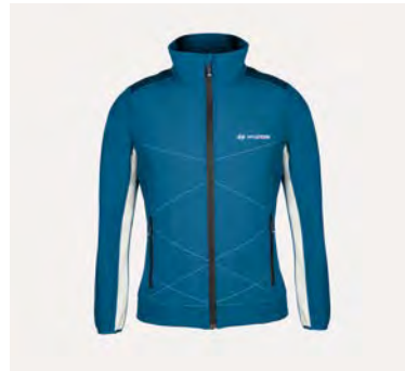
Softshell jacket, women