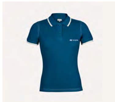
Polo shirt, women

Wherever you go, you'll cut quite a figure in these stylish complementing garments. A Hyundai collection made to match any weather condition. Worn according to the onion principle, you'll ride out whatever the skies send after you. Whether you're exploring a canyon or a city - you'll be able to adapt to wind, rain, sun and cold.