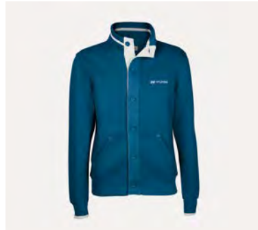
Sweat cardigan, men