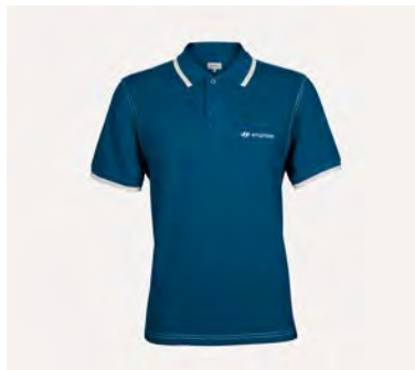
Polo shirt, men