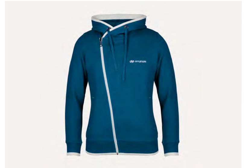
Sweat jacket, women