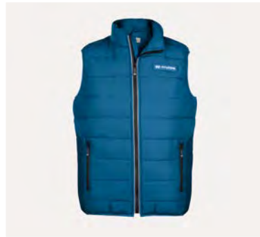
Down vest, unisex