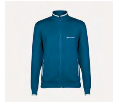
Sweat jacket, men