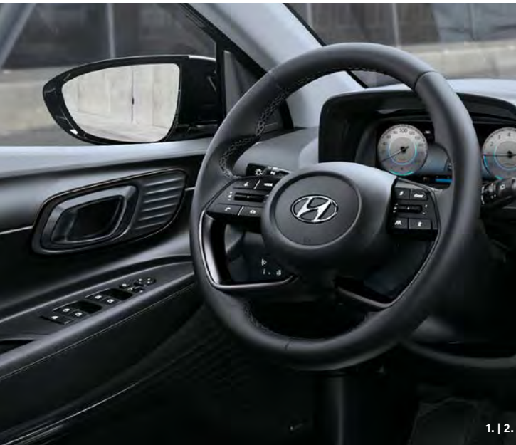
1. | 2.