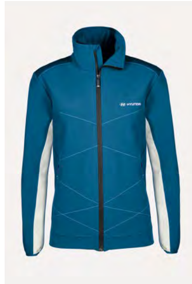
Softshell jacket, men